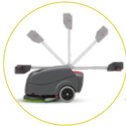
Folding handle for storage and transport