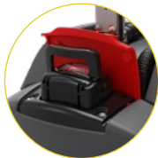
Easy battery change