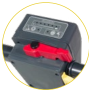
Simple soft-touch controls