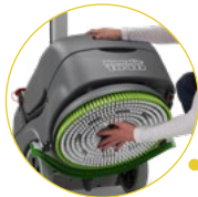
Simple pad/brush change